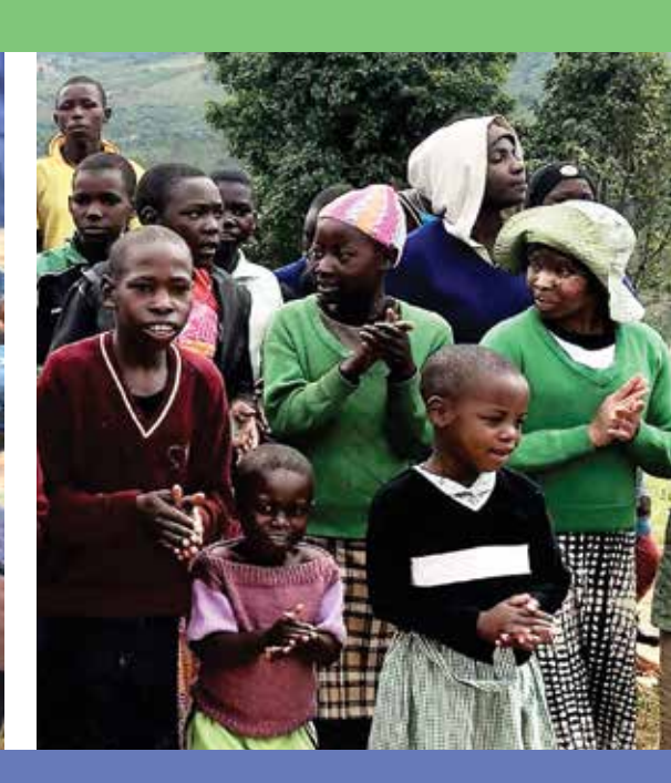
2016 ANNUAL REPORT